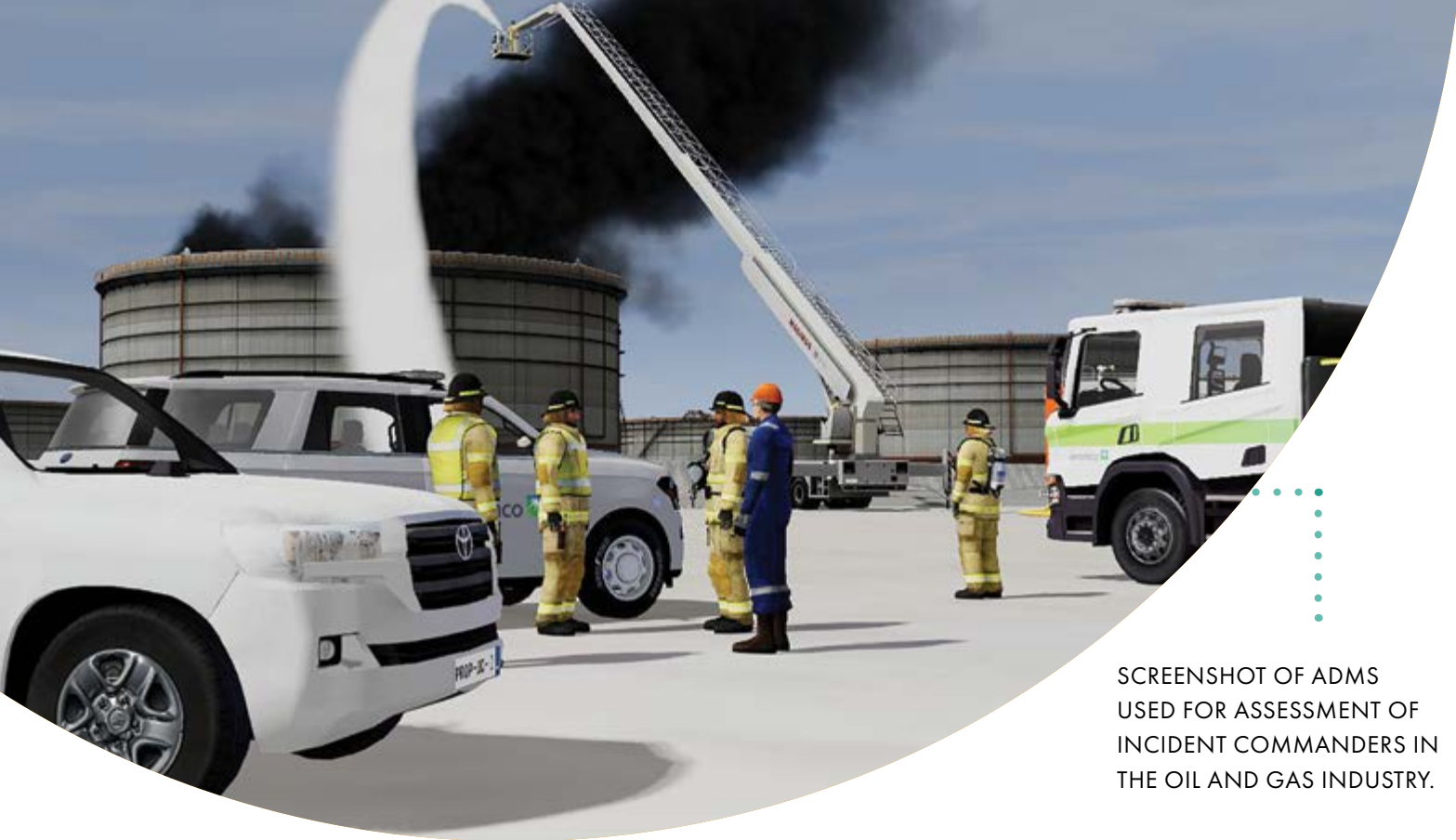
SCREENSHOT OF ADMS USED FOR ASSESSMENT OF INCIDENT COMMANDERS IN THE OIL AND GAS INDUSTRY.

ETC Simulation has further strengthened its position within the airport, industrial, and military markets. We delivered airfield driving simulators to a major US airport including airport terrain with intelligent ground vehicle and aircraft traffic. In partnership with one of the world’s largest manufacturers of firefighting equipment, we delivered several airport fire truck simulators with airport terrains for their civil and military clients. We were awarded a contract to deliver an airport fire truck simulator for a military customer in Asia and for a US military customer we developed scenarios to train for airbase security operations.