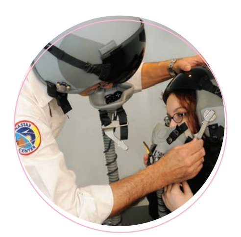
Altitude chamber training prepares you to cope with the rigors of high-altitude flight.