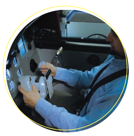
The GYROLAB GL-2000 simulator replicates the dynamics of an upset condition.