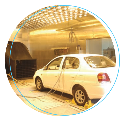
ETC Testing & Simulation Systems Drive-In Test Chamber