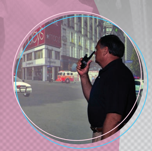
ETC's Advanced Disaster Management Simulator made solid strides in fiscal 2014

Our commitment to integrity includes outreach to the community in which we work. Our NASTAR Center provides supplemental STEM education through summer camps for students in grades two through twelve, as well as classes for teachers. We are proud of our work in the development of knowledge and excitement in the next generation of aerospace enthusiasts.