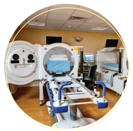
ETC's BARA-MED Select Hyperbaric Chamber